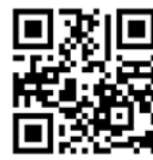
THE GLAD SPIRIT