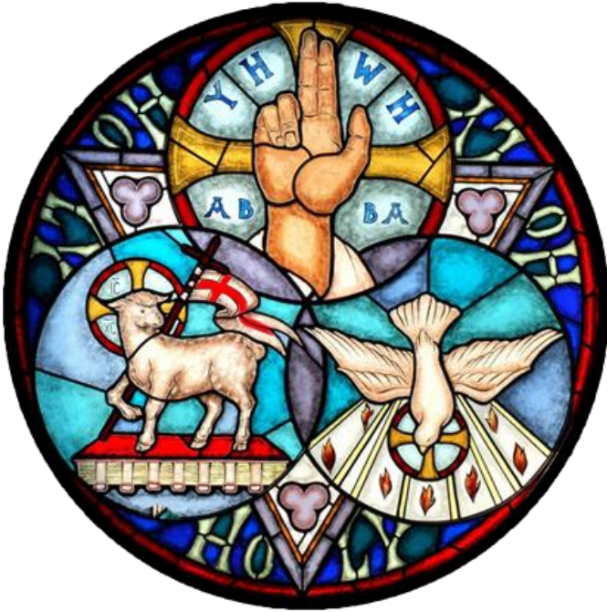
The Holy Trinity May 31, A+D 2026