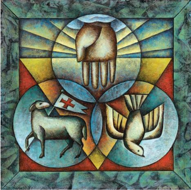
The Holy Trinity May 26, A+D 2024